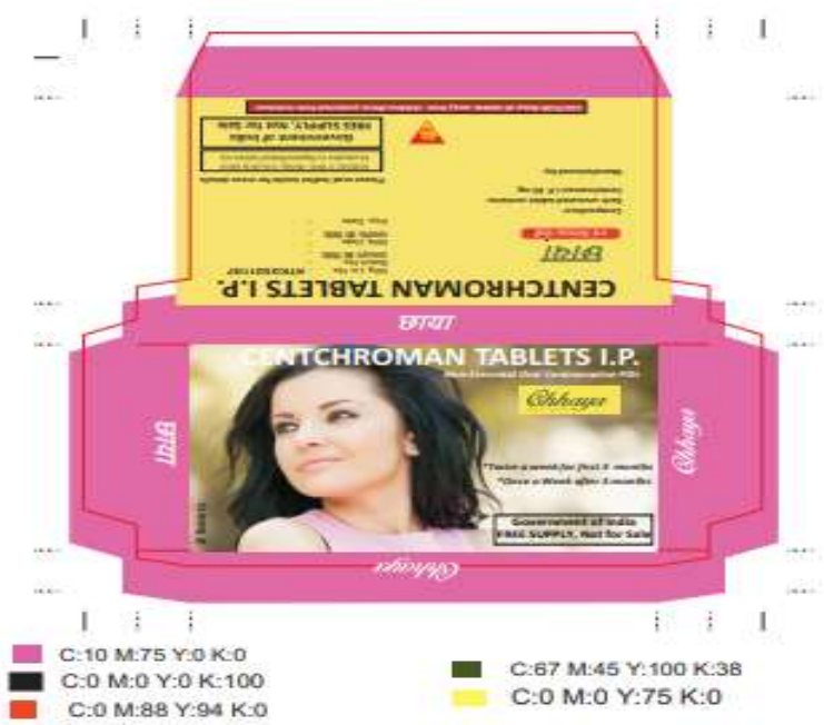
Figure - 2 a